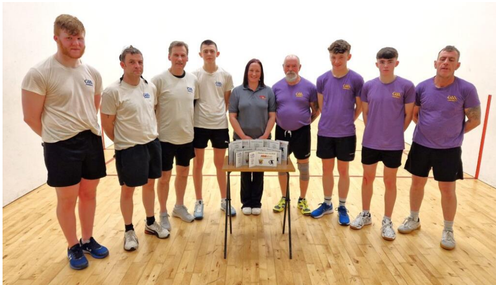
Acme Blinds & Commercial Products team final