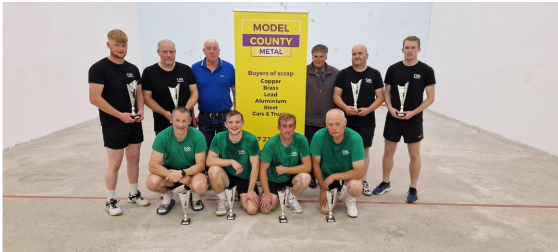
Model County Metal team final