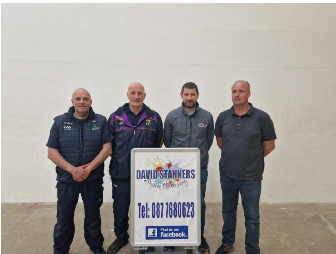
David Stanners Painting & Decorating