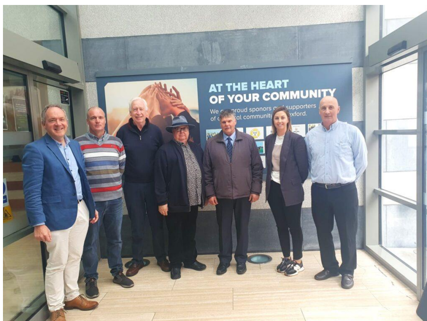
Wexford Credit Union sponsorship launch

On your behalf I take the opportunity to thank our sponsors for their interest in and support for handball and I hope that they too benefitted from our partnership. I urge everyone to support our sponsors in any way they can, especially when their needs coincide with what our sponsors have to offer.