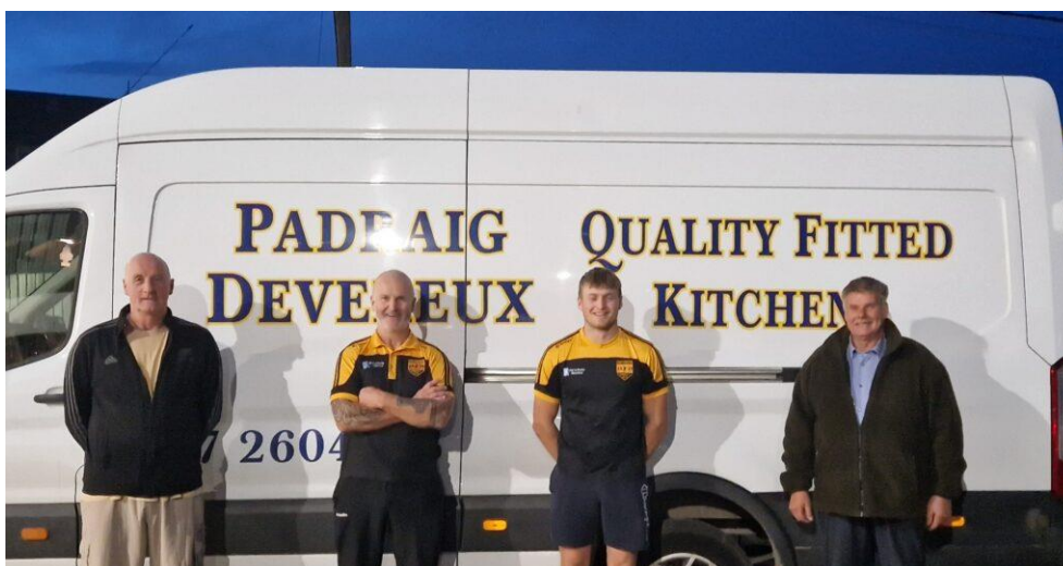
Padraig Devereux Fitted Kitchens