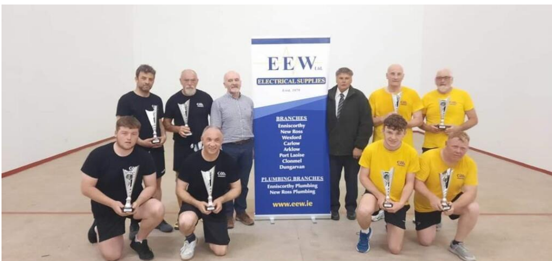
EEW Electrical Supplies team final