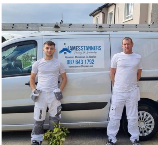
James Stanners & Sons Painting/Decorating

I am confident that we have the product to attract further sponsorship opportunities in 2024, when we could consider offering individual grades sponsorship (such as senior) as an alternative to full championship sponsorship under one name. The possibilities are endless, as long as we continue to run our competitions in a professional manner, augmented by extensive social media exposure and live streaming.