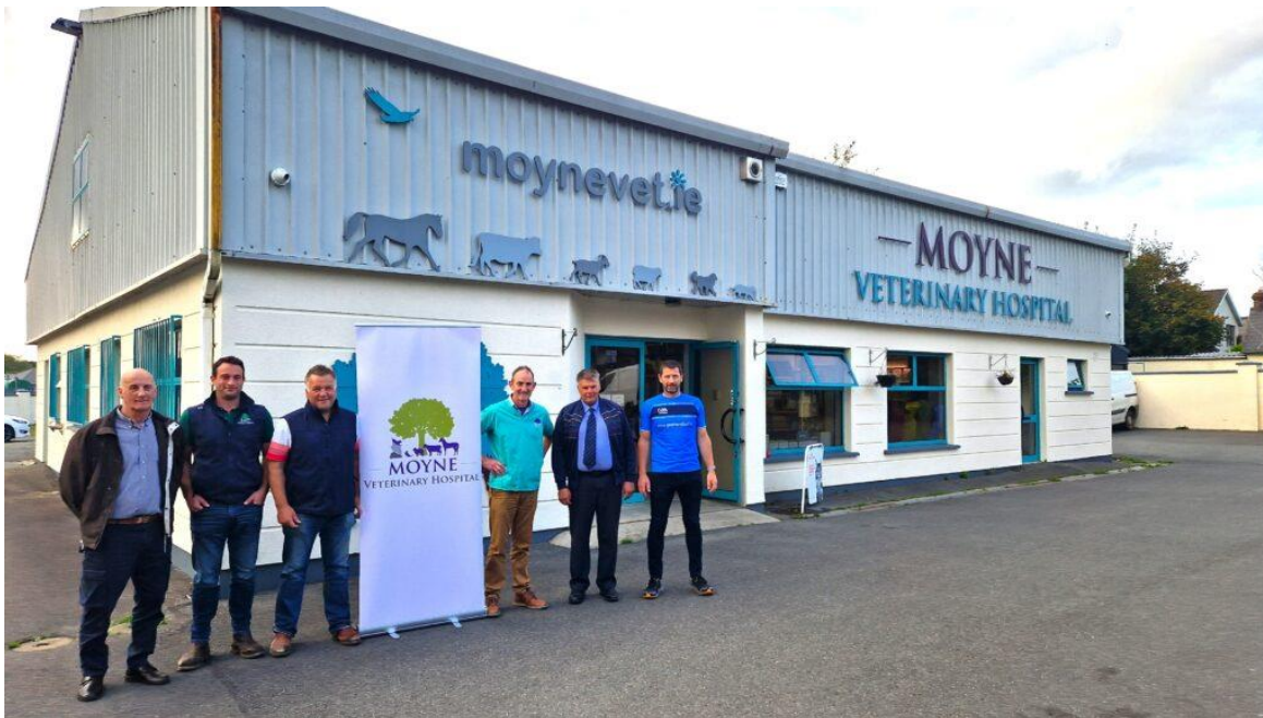
Moyne Veterinary Hospital