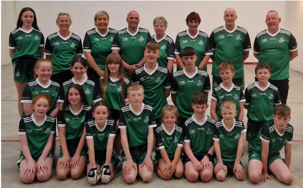
Templeudigan new playing attire