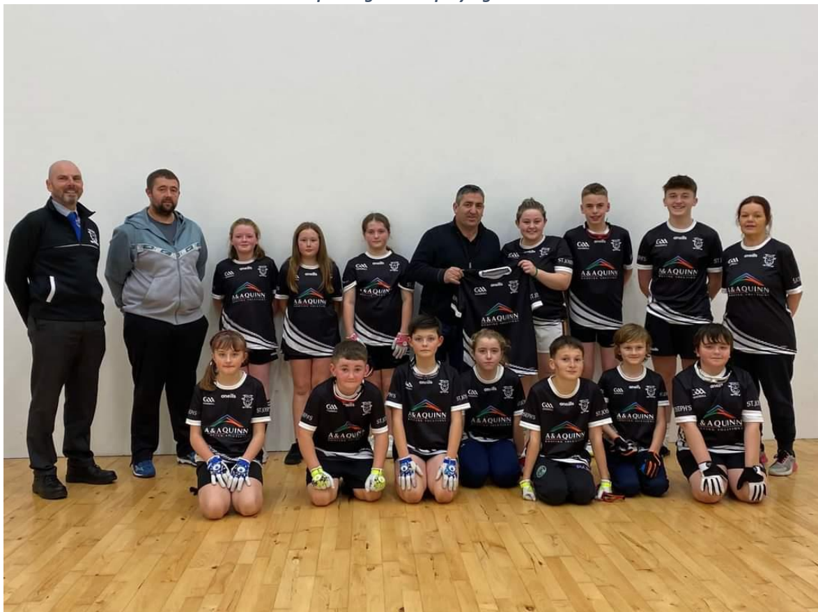
St Joseph's new playing attire